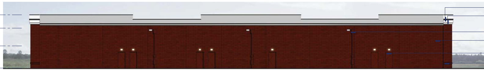
SOUTH ELEVATION 1/8" = 1'-0"

T/O HIGH PARADEET ELEV = 24'-0" AFF W/S ROOF DECK (HP) ELEV = 18'-0" AFF T/O STOREFRONT ELEV = 10'-0" AFF FINISHED FLOOR = 1150.82 ELEV = 0'-0"