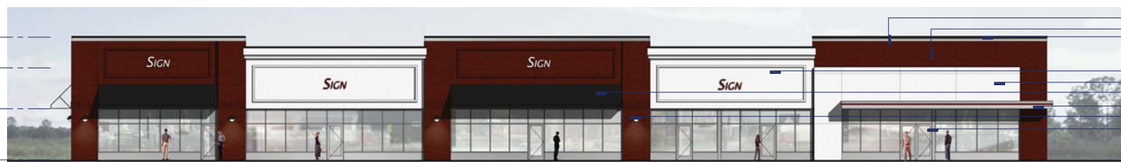
NORTH ELEVATION 1/8" = 1'-0"

T/O HIGH PARADEET ELEV = 24'-0" AFF W/S ROOF DECK (HP) ELEV = 18'-0" AFF T/O STOREFRONT ELEV = 10'-0" AFF FINISHED FLOOR = 1150.82 ELEV = 0'-0"