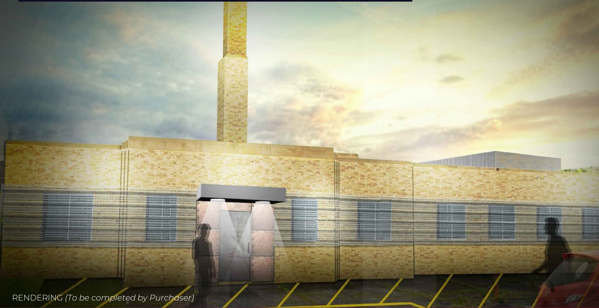
RENDERING (To be completed by Purchaser)