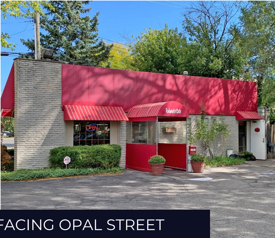
FACING OPAL STREET