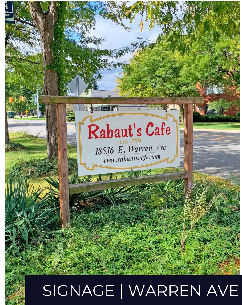
SIGNAGE | WARREN AVE