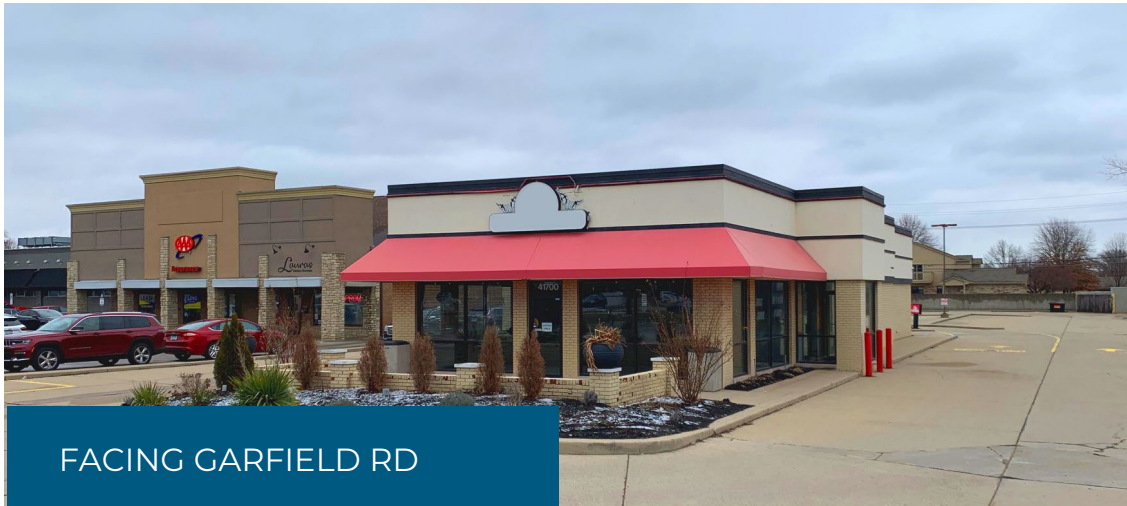
FACING GARFIELD RD