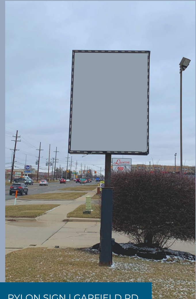
PYLON SIGN | GARFIELD RD