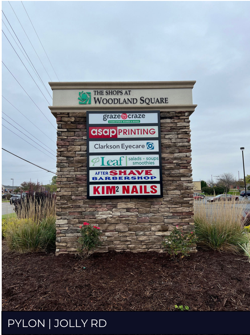
PYLON | JOLLY RD