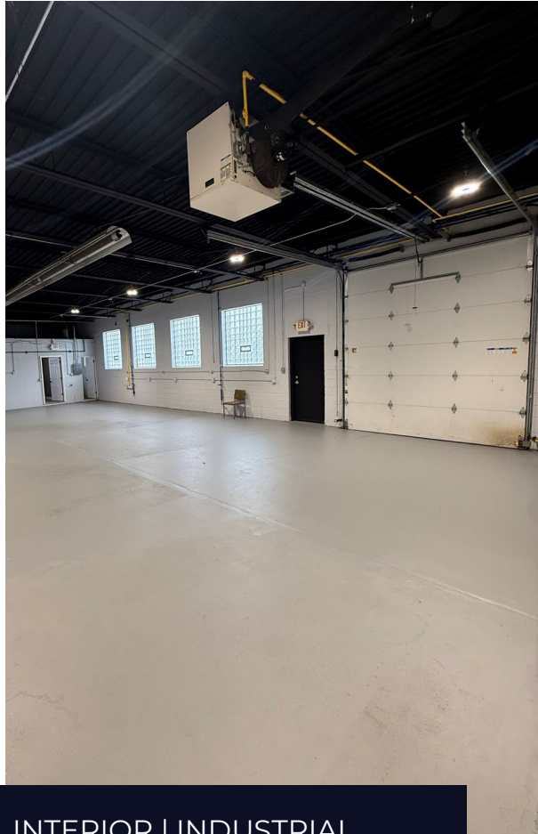
INTERIOR | INDUSTRIAL