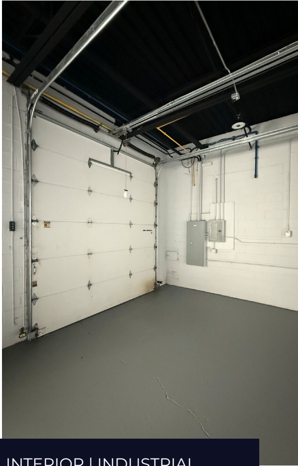
INTERIOR | INDUSTRIAL