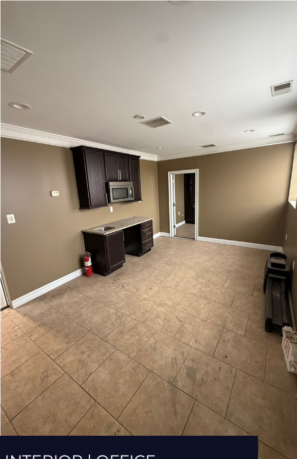
INTERIOR | OFFICE